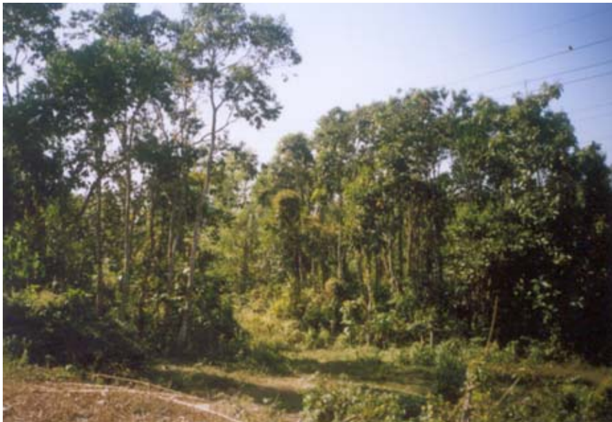
Photo 14: A partial view of the Long trail (one of the beautiful remaining patches of forests at Chunati WS)

As you go along you will find an intersection of three trails: a small trail going towards Aziznagar Beat. The soil of the trail and the straight trail goes to the paddy field. Go along the left trail uphill and move forward through steep hills to reach the bottom of