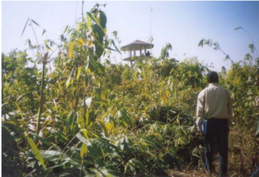
Photo 9: A partial view of the Medium Trail- nearby the 1 st Watch Tower

The trail becomes sandy ((Photo 8) reaching a stream that you need to cross to have a view of Bamboo sheaths, Sal trees and paddy fields. Go uphill through bamboo sheaths and turn right towards Watch Tower. This portion of the trail is narrow and goes through Sun grass and undergrowth of Phuljharu . You may see signs of elephants coming to this place frequently. Move through the steep hilly path through bamboo sheaths and gradually turn right towards the Tower at hill top (Photo 9).