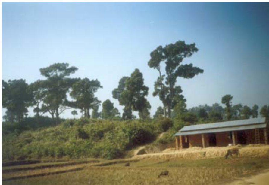
Photo 4: End of the Short trail (near to Euro-Asia Poultry Hatchery)

Move along the valley to your right and you will reach a small trail that ultimately reaches the main metallic road. There are a few trees around the hills and some paddy lands around. Follow the trail and you will find some of the villager's houses at your left. Gradually the trail moves beside EuroAsia Poultry Hatchery (Photo 4) and reach the main road. The trail ends at this point. A milestone is seen here on which "Cox'sbazar 81, Chokoria 23" is written.