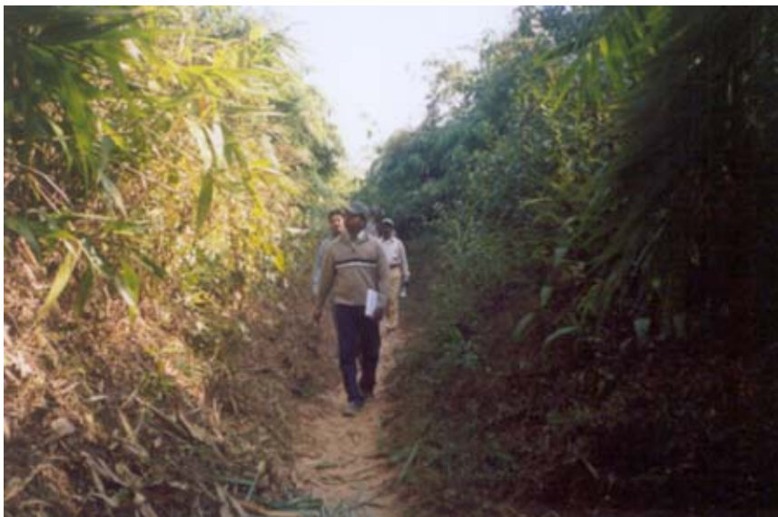
Photo 8: A partial view of the Medium trail- passing through the bamboo forest

Move forward, towards a valley with some fruit bearing trees and dense undergrowth of Bamboo and Asam lata gach . After a certain distance, the sandy trail goes through bamboo sheaths where birds like Dove ( Ghughu ) may be seen singing.