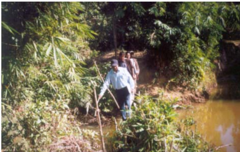
Photo 17: A partial view of the Long trail (an old wooden bridge on the trail crossing a stream at Chunati)

The trail here is sandy with scrubby undergrowth. Turn left and go through the sandy wide trail towards a place called Moner jhiri . There are Jam trees surrounding the trail but the number of the trees is gradually decreasing as you go ahead towards the trail that goes to Chunati Beat Office. Turn left to catch another trail that returns to the main road near Range office.