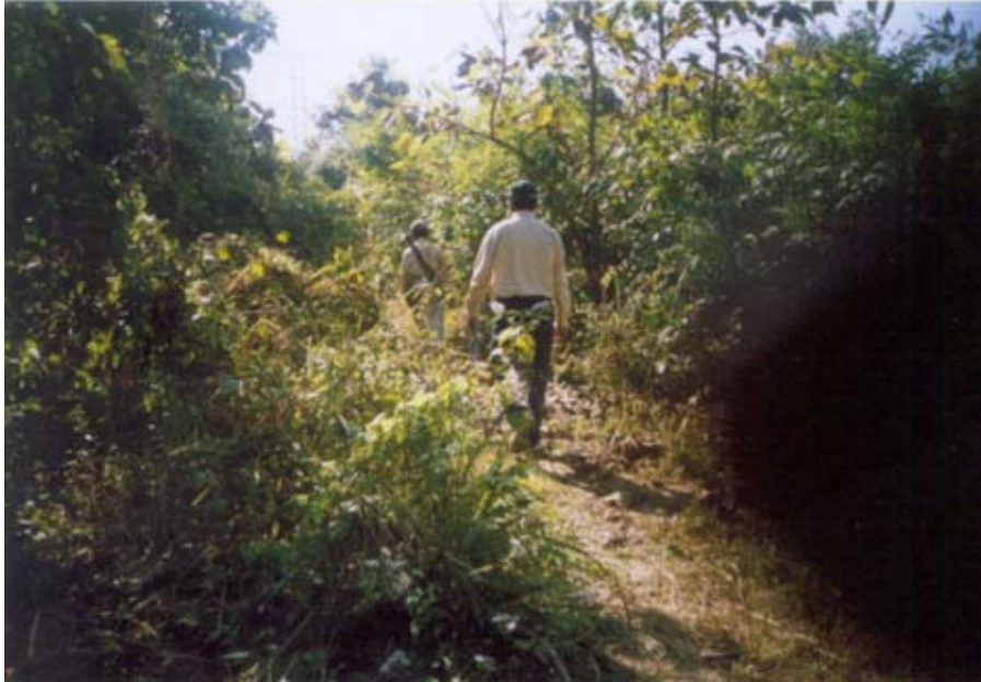
Photo 13: A partial view of the long trail passing through the plantations

Move along, to reach fodder plantations of Jalpai , Amloki , Haritaki , Bahera , Kamranga , Kathal , Jam , Banana , Bat , Bamboo , Dewa , and Chapalish . Afterwards, the trail is sandy and goes up. A trail on left goes to main road but you have to follow the right trail that passes through bamboo sheaths around. On left the valley looks beautiful and the undulating trail passes through Teak plantations.