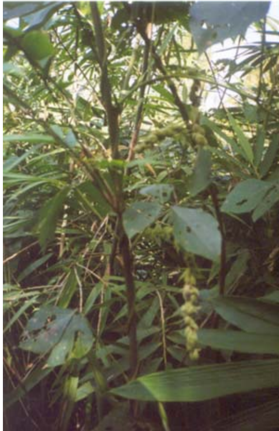
Photo 10: Chai lata , a kind of climbers may cause serious itching