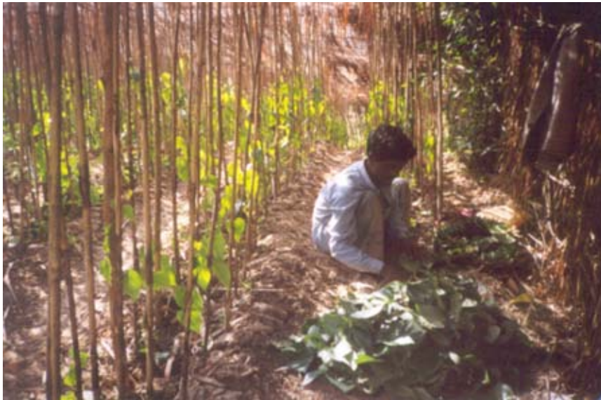
Photo 7: A betel leaf cultivator sorting out the leaves after harvesting

Move forward towards another intersection of the trails and follow the left trail that goes through dense bamboo sheaths. To your left you will find a betel leaf cultivation area ( Paner baraj ) (Photo 7), where you may stop for a while to know about how betel leaves are grown, harvested and sorted for marketing.